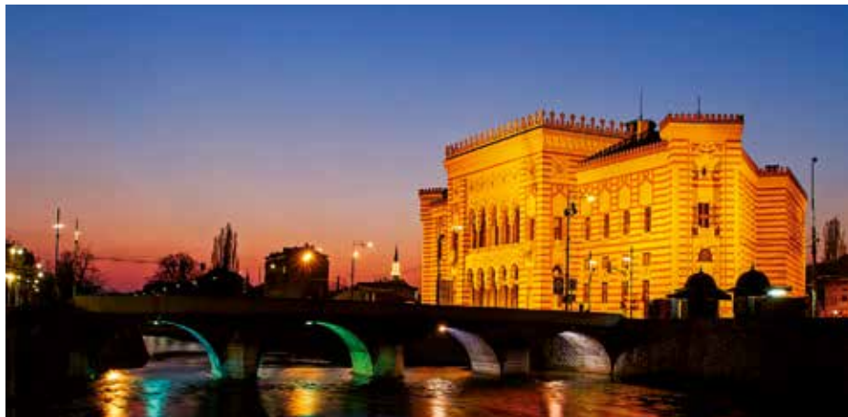
Vijecnica (st. Obala Kulina Bana)

All delegates are cordially invited to enjoy the opening ceremony on Friday, 5th September at 19:30 in the Vijecnica (City Hall) in the old center of Sarajevo. After the opening ceremony, you are invited to the dinner at the Vijecnica (City Hall).